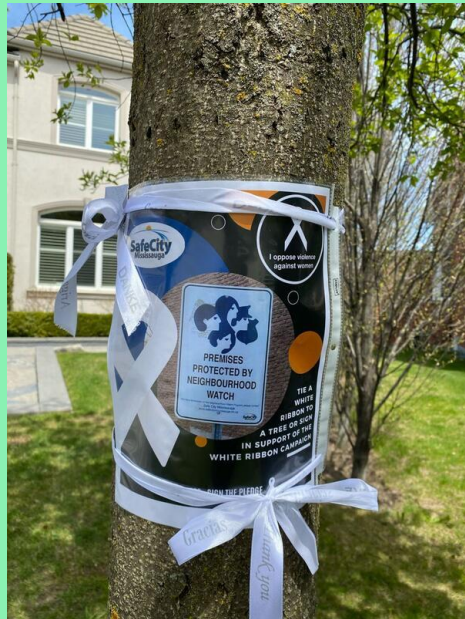
Foxmill Court Neighbourhood Watch

From May 1st to May 8th, Safe City Mississauga ran the White Ribbon social media campaign to create awareness of violence against women in a time when domestic violence on the rise. In response, some of our amazing Neighbourhood Watches and community partners tied White Ribbons out in the community to show their support. Thanks to our friends at the Foxmill Court Neighbourhood Watch, BTI Brands Inc. in Streetsville, and the Centretown and Desborough Neighbourhood Watches for your participation!