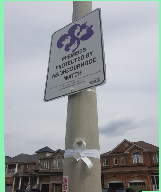
Centretown and Desborough Neighbourhood watch

It's never too late to show your support! Feel free to tie a White Ribbon out in the community or take a selfie showing your support. Share the image and tag us on social media. Please follow us on our social media handles below: