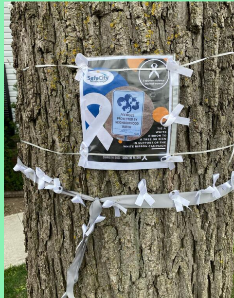
BTI Brands Inc.