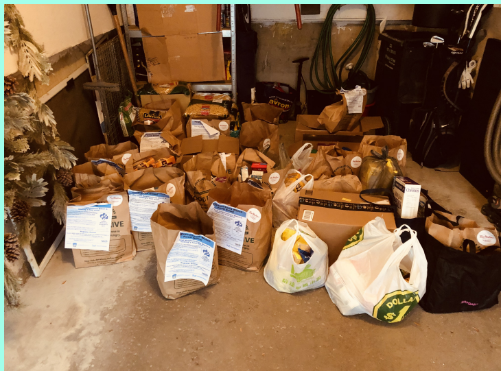
Just SOME of the food collected by South Parade Court!