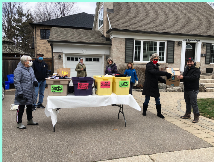
Clothing Drive in action at Applewood Road!

Consider the effects of food insecurity and poverty on crime prevention. Consider the criminal activities one might have to consider just to put food on the table in times of desperation. Consider the stress that food insecurity and poverty can have on mental health, and how mental health under strain can encourage deviant and/or criminal behaviour.