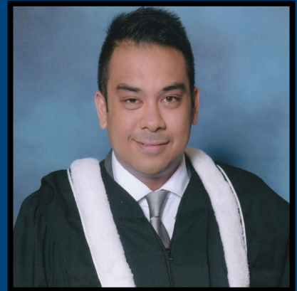
Outreach/Volunteer Engagement Lead, Jul 2018-Jun 2019