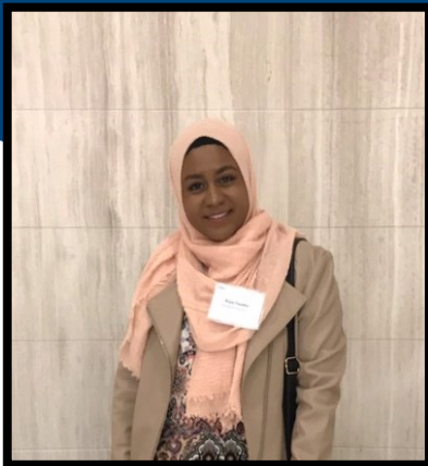
Communications/Safe City Ambassadors Lead, Jul 2018-Jun 2019